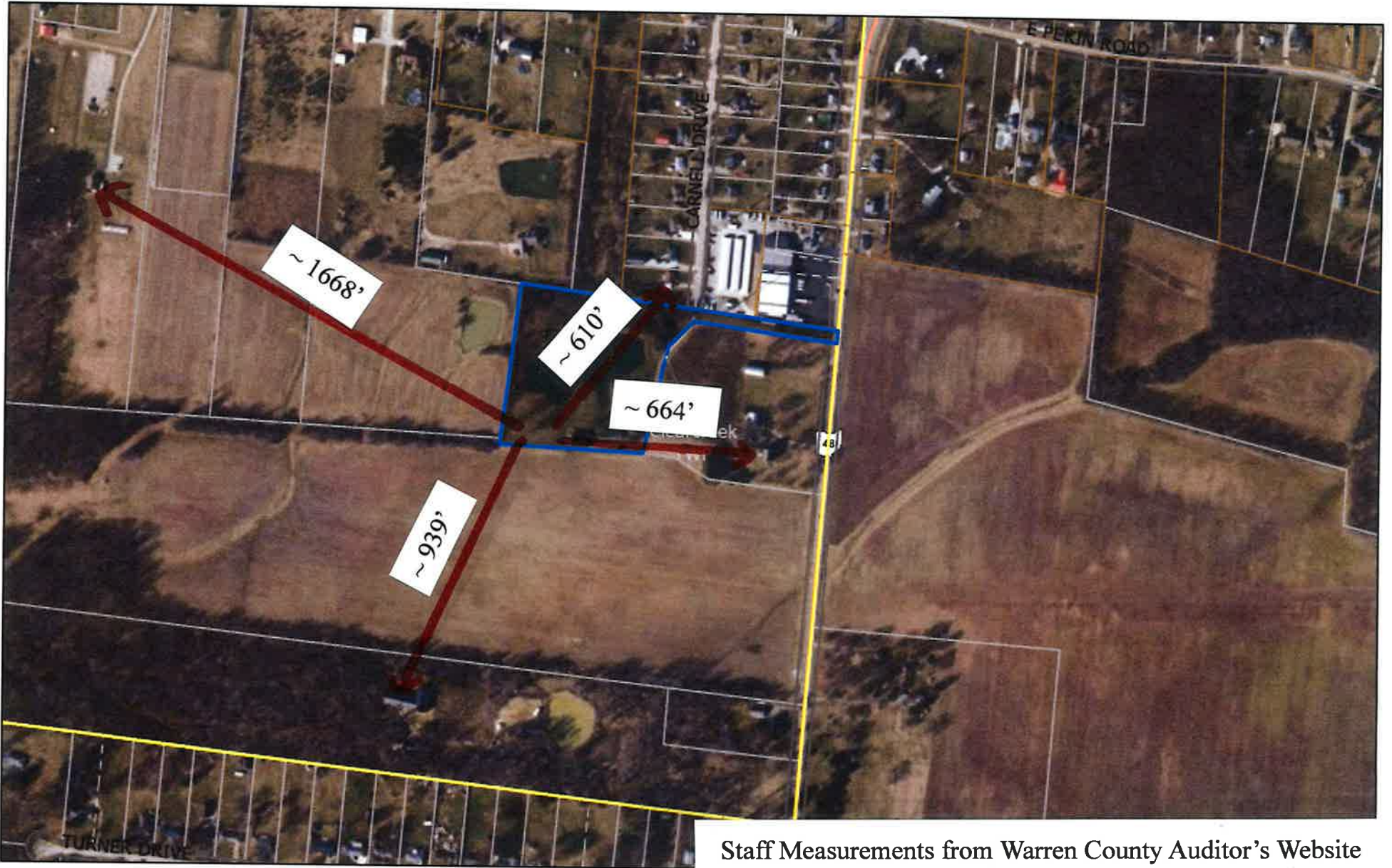
Staff Measurements from Warren County Auditor's Website