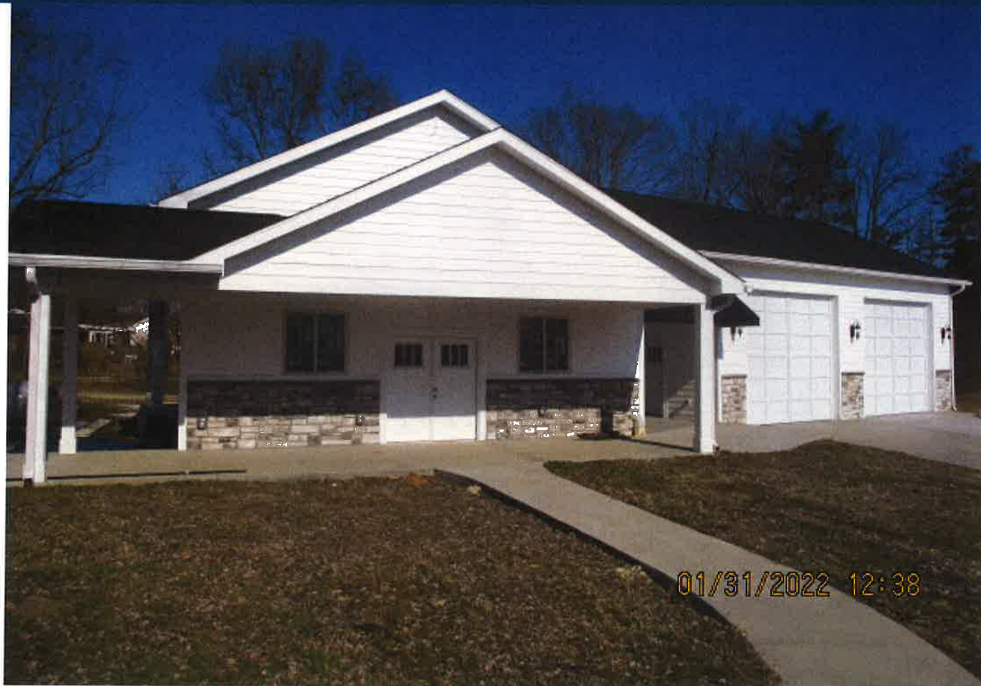
Date Taken: 1/31/2022